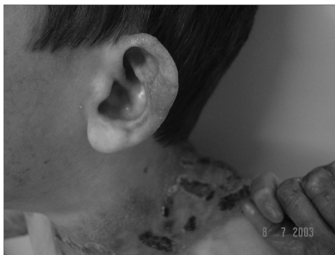
Figure 4. Scar lesion in the ear (milia).