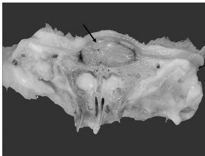
Figure 3. Sagittal section of specimen showing cellulose included in the dorsum of the nose (arrow)

After insertion of the cellulose sponge in the tunnel, 3.0 mononylon sutures were done to close the frontal incision; at this point the procedure was ended. The animals were given 1 ml intramuscular benzilpenicillin benzatin and 0.2 ml dipyrone.