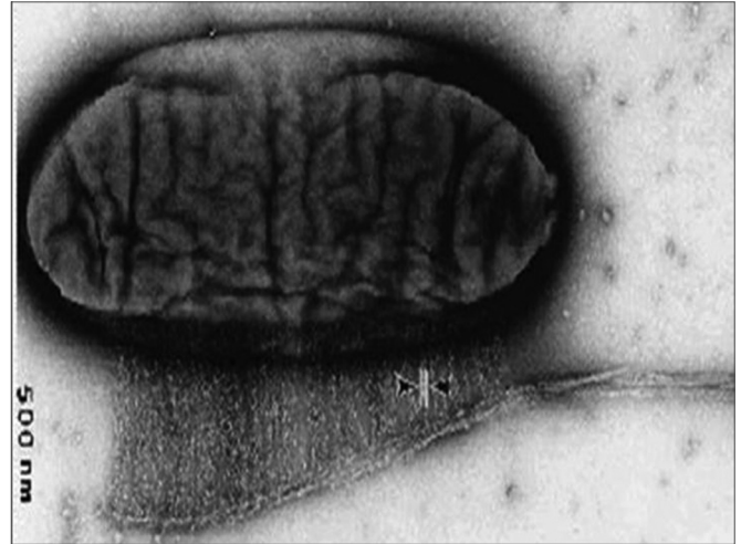
Figure 1. Microscopy of Acetobacter producing cellulose

been tested in a variety of applications, from artificial skin to bullet-proof vests, computer screens and paper for preserving historical documents. 8 (Fig. 1)