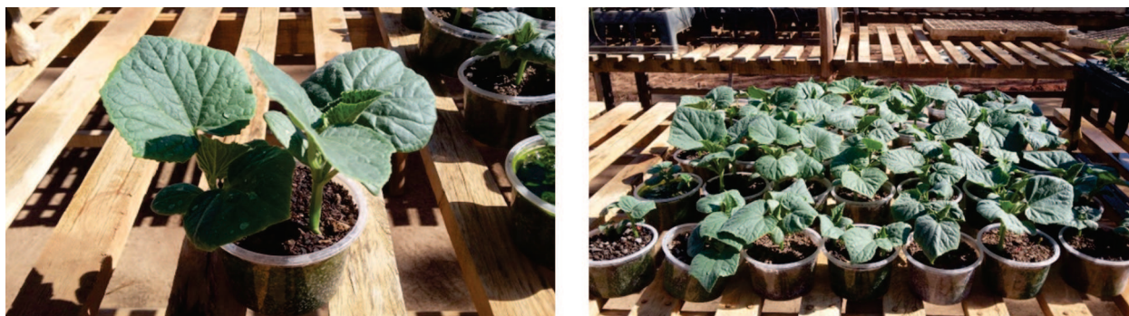
Figure 2: Cucumber cultivation for evaluation of vermicompost phytotoxicity produced by sewage sludge and diatomaceous earth.

of avoiding injury to plants. In this case, it is important to add at least 18% DE for EC reduction at a suitable level for plant cultivation. It can be found in the works by Oliveira et al. , (2002) data evidencing that increasing applications of sewage sludge doses in the soil rise the electrical conductivity.