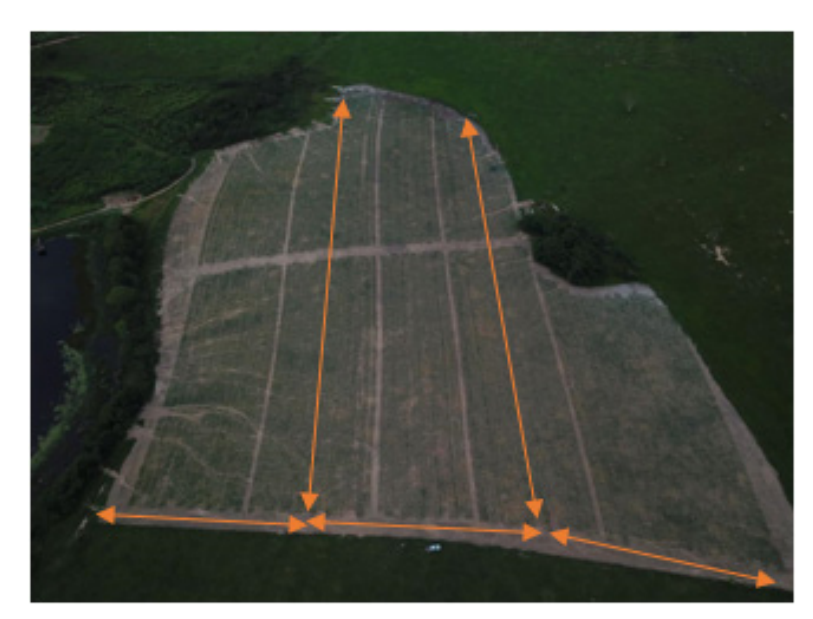
Figure 1: Delimitation of the experimental area for the intercopped cultivation of Feroz VIP3<sup>®</sup> transgenic maize and Brachiaria bri zantha cv. Xaraés in the Crop-Livestock Integration (CLI) system.

insect (Udayakumar et al. , 2021). Thus, it is suggested that herbivory-induced volatiles from transgenic maize and B. brizantha plants attracted natural enemies of S. frugiperda and stabilized its attack on these crops.