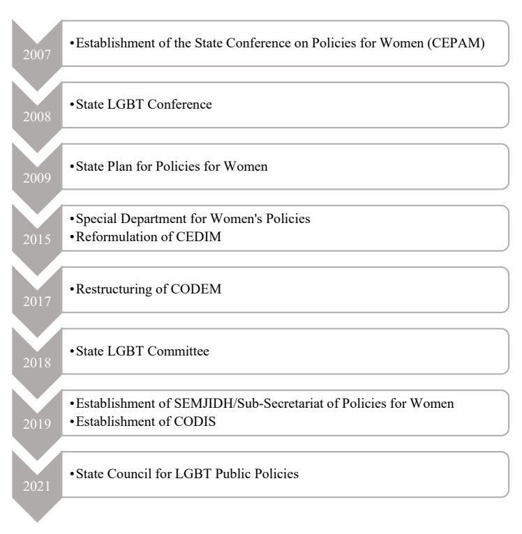
FIGURE 2 GENDER POLICIES: MAIN MILESTONES (RIO GRANDE DO NORTE – 2007/2021)

Gender mainstreaming comprises a process of disputing the hegemony of public action. Therefore, it is important for institutional conditions to be developed, so that this process is facilitated, although their existence does not guarantee the effective incorporation of gender equality perspectives in public policies. In addition, discontinuities and contradictions may occur during this trajectory, which compromise institutional sustainability. Figure 2 is provided below, in order for us to discuss the main results demonstrated for the two policies analysed in Rio Grande do Norte, and to enable analytical and critical reflection on the summarized data.