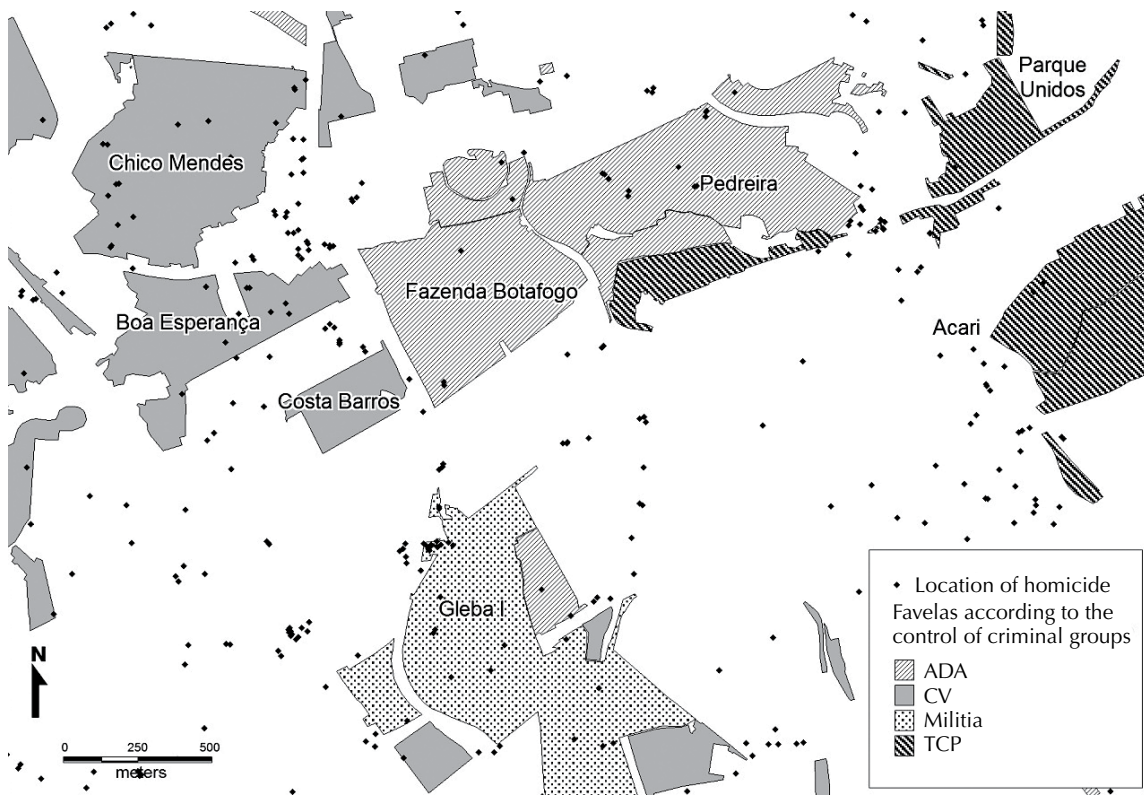
ADA: Amigos dos Amigos ; CV: Comando Vermelho ; TCP: Terceiro Comando Puro ; UPP: Police Pacification Units