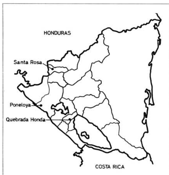
Fig. 1 - Map of Nicaragua indicating the location of the three rural communities surveyed for Chagas' disease.

A matched case-control design was followed to determine electrocardiographic abnormalities attribu-