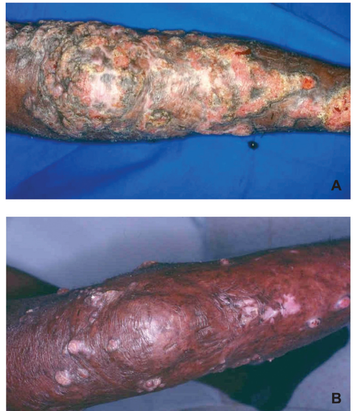
Fig. 2 - Response of chromoblastomycosis to posaconazole therapy (patient 11): A) at presentation before posaconazole treatment; B) after 12 months of posaconazole therapy.

relapse rate. For example, in the case of eumycetomas, clinical assessment includes changes in nodule diameter and the amount of purulent secretions, and the disappearance of sinus tracts. Eradication of the pathogen is difficult to prove, even when deep biopsies are performed. In our experience, we have observed relapses in several patients in whom bone biopsy cultures were negative. Additionally, clinical response varies by the causative species. Because of these circumstances, long-term follow up is required for these patients.