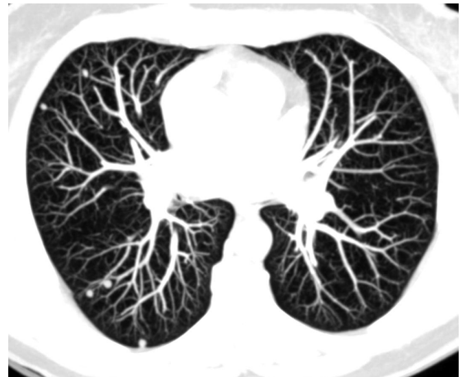
Fig. 1 - High-resolution axial CT scan with MIP technique that highlighted pulmonary nodules shows numerous small nodules in random distribution.

(MIP) technique that highlighted pulmonary nodules showed numerous small nodules in random distribution. The high-resolution coronal CT scan with MIP technique demonstrated a right lung nodule with feeding vessel sign, which occurs in pulmonary metastasis (Fig. 1 and 2). Histopathological examinations of lung biopsy specimens stained