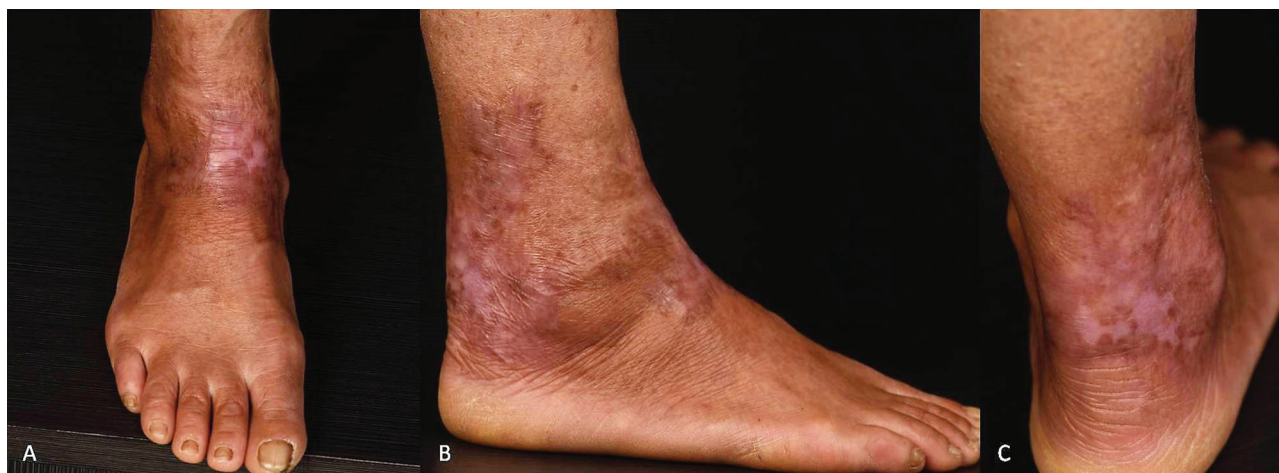
Figure 3 - Aspect of the right ankle and the lower leg of the patient with chromoblastomycosis caused by F. nubica zssy0803 after treatment with the combination of amphotericin B and terbinafine (A-C).

The susceptibility testing of F. nubica zssy0803 showed a MIC of 0.25 µg/mL for TBF and 2 µg/mL for ITZ. There are no recommended standards for the susceptibility testing result of Fonsecaea species. However, in comparison with previous antifungal susceptibility testing results for