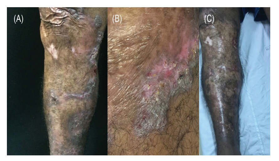
Figure 1 - Erythematous-violaceous infiltrated verrucous borders lesion with hematic crusts extending anteriorly from the upper border of the right knee to the lower third of the right leg (A) and a plaque with a dyschromic atrophic center (B). Regression of cutaneous lesions six months after the beginning of treatment with an atrophic plaque in the entire region, previously affected, on right lower limb (C).

The patient received a combined treatment for six months composed of ethambutol 400 mg three times a day for three months, rifampicin 300 mg twice daily for six months and trimethoprim-sulfamethoxazole (160 mg + 800 mg) twice daily for six months; topical treatment was not performed. The verrucous lesions disappeared (Figure 1C), leaving a dystrophic atrophic plaque in the affected region, with no relapse to date.