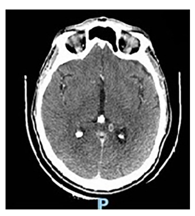
Figure 3 - High-resolution computed tomography scan of the brain showing a ring-enhancing lesion in the splenium of the left corpus callosum.

the clinical presentation and possible pathogenesis of this case deserve to be mentioned. First, esophageal involvement rarely occurs in non-immunocompromised patients with PCM—we were able to retrieve only seven cases of this occurrence in the literature, all except one in patients with the CF of PCM<sup>7-12</sup>. The typical pattern in the CF of PCM is the development of oropharyngeal lesions, which represents the farthest localization reached by the fungal spread through the lymphatic route<sup>13</sup>. In these cases, the fungi arise from the primary pulmonary foci and spread through the intrapulmonary lymph nodes, hilar nodes, and subsequently the paratracheal nodes, reaching the mucosa through inverse lymphatic flow. Radiology imaging evidences compromised deep lymphatic chains underlying the mucosa and other localized lesions<sup>14-16</sup>. For unknown reasons, in the patient described here, the lymphatic spread alternatively drove the fungi to the esophagus, sparing the oropharyngeal mucosa. In the single report of an A/SAF patient with esophageal lesions in the literature, this involvement was, differently from the esophageal lesions of CF patients, probably due to contiguous spread, since the lesions were described as secondary to mediastinal lymph node enlargement that fistulized to the esophagus<sup>12</sup>.