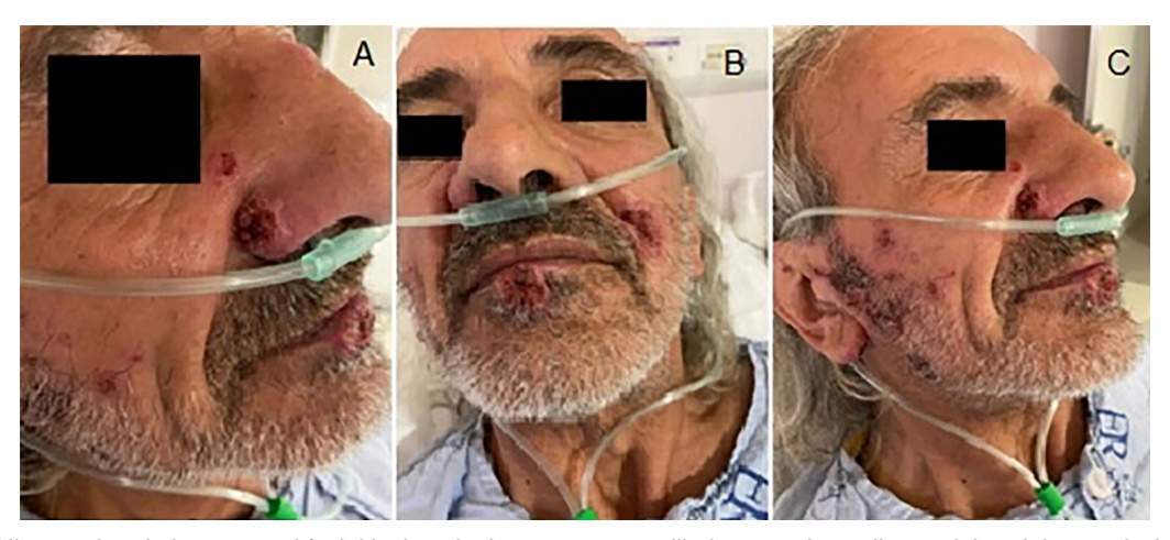
Figure 1 - Ulcerated and ulcer-crusted facial lesions in the temporomandibular area, lower lip, ear lobe, right nasal wing and jaw.