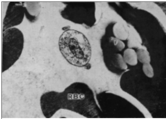
Figure 1 - Photomicrograph obtained after filtration of T. cruzi -contaminated PRBC by a WBC-reduction filter. Transmission electron microscopy showing fibers (F) in cross-section, red cells (RBC), and a trypomastigote form of T. cruzi (T). Magnification x 11.500.

showed that T. cruzi parasites were removed from contaminated PRBC and PCs primarily by mechanical mechanism with parasites not