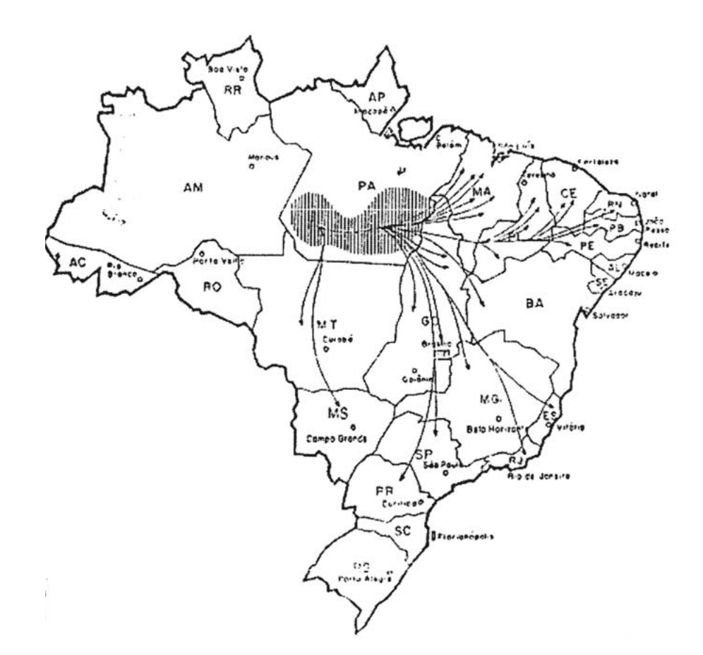
Figure 3 - Trace back diagram of malaria cases occurring in 1992 outside of Amazonia, data from da Souza JM. The shaded area in the State of Pará (PA) indicates the region in which all traced cases were found to have contacted plasmodia; this is the region of intensive gold mining of the Tapajós watershed. Abbreviations for states of Brazil: PA – Pará; MT – Mato Grosso; GO – Goiás; MA – Maranhão; CE – Ceará; MS – Mato Grosso do Sul; MG - Minas Gerais; BA – Bahia; RJ – Rio de Janeiro; ES – Espírito Santo; SP – São Paulo; PR – Parana: PI – Piaui; RN – Rio Grande do Norte; PB – Paraiba; PE – Pernambuco; AL – Algoas; SE – Sergipe; AP – Amapá; RR – Roraima; AM – Amazonas; RO – Rondonia; AC – Acre; SC – Santa Catarina; RS - Rio Grande do Sul (Note: Tocantins is not shown).

Mercury exposure among the miners may also play a role in malaria transmission in Brazil. Mercury is known to affect the immune system. Mercury induced autoimmunity is associated with nephropathy in rodents and humans<sup>11 13</sup>. Recent studies in which mice were exposed to non-lethal doses of malaria showed an attenuated Th1 immune response, ultimately resulting in decreased release of macrophage and splenocyte nitric oxide<sup>27 28</sup>, which is specifically instrumental in a normal immune response to malaria and acquisition of immunity in a murine model<sup>31 32</sup>. We have also found that low doses of mercury increase