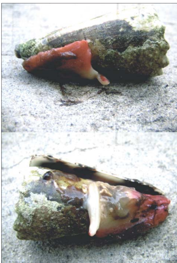
Figure 2 - A live specimen of Conus of Mozambique – Indian Ocean – showing the proboscis (probable Conus imperialis ).