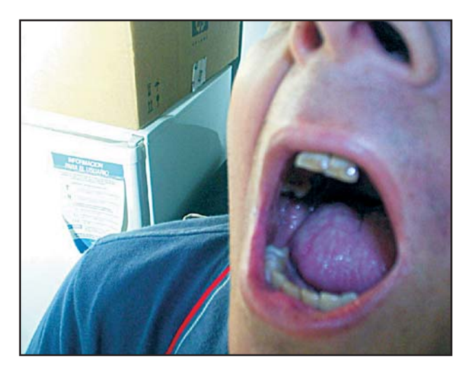
Figure 3 - Complete remission of the neoplasm after six cycles of chemotherapy plus HAART.

cyclophosphamide, doxorubicin, vincristine and prednisone (CHOP), every 21 days and up to a total of six cycles, supporting by granulocyte-stimulating colony factor, with a complete remission of the neoplasm (Figure 3).