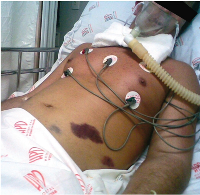
FIGURE 1 - Petechial hemorrhagic suffusion, on the thorax and abdomen of a patient with Plasmodium vivax malaria.

carvedilol and was maintained in negative fluid balance. A thick blood smear was negative to Plasmodium sp to day 5, and after 12 days of treatment, he was discharged (February, 11 th , 2009) in regular health and administered carvedilol (1 tablet, 2 times/day).