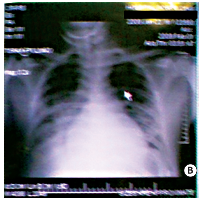
FIGURES 2A and 2B - Chest radiography showing cardiomegaly and acute edema of the lung in a patient with Plasmodium vivax malaria.

in addition to the first P. vivax malaria episode in six patients who presented with cardiac involvement (from a series of 22 malaria cases admitted in a German hospital) 2 . Similarly a case of myocarditis associated with primary P. vivax malaria has been reported in a woman from South Korea 3 . Though these primary cases were related to the absence of specific immunity to the parasite, severe cases, including cardiac damage, may occur in patients with previous malaria who have some degree