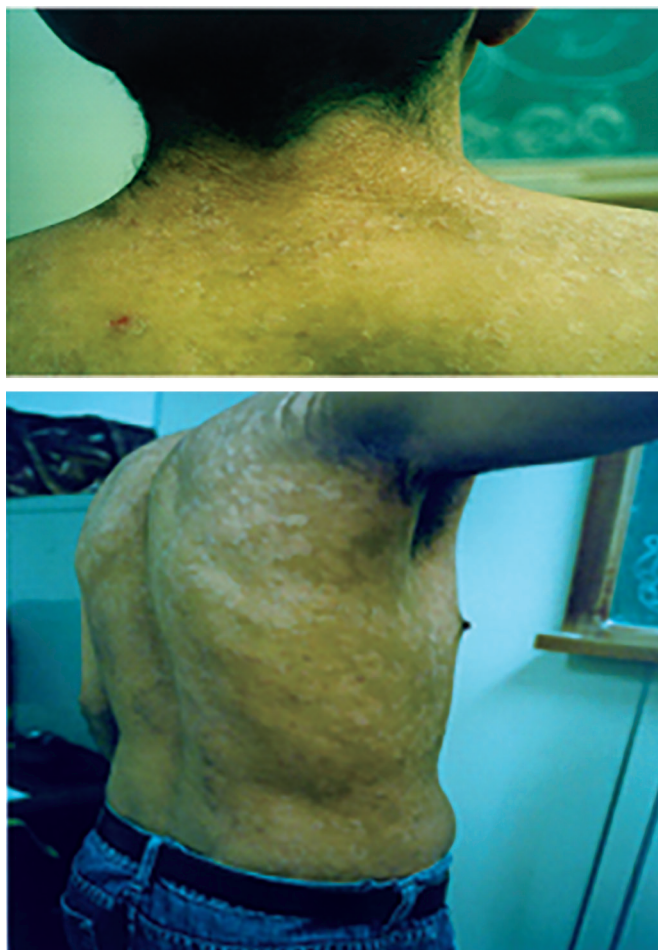
FIGURE 1. Photographs of the patient showing disseminated dermatophytosis due to Trichophyton rubrum . He presents typical and atypical lesions of dermatophytosis. These atypical lesions may be associated with a failure of the immune system to control the fungal infection.

hyaline hyphae, and macroconidia like small droplets located in parallel with the hyphae. Fungal cultures incubated for 4 weeks at 25°C on BD Mycosel Agar and BD Sabouraud Agar with chloramphenicol and cycloheximide (BD Biosciences, Franklin Lakes, NJ) revealed a dermatophyte with the morphology of Trichophyton rubrum , showing cotton wool-like filamentous colonies that had a raised center (obverse) and red pigmentation in the reverse view. Abdominal ultrasonography revealed hepatosplenomegaly. The liver showed characteristics of chronic hepatic disease with portal hypertension, and consequent splenomegaly (volume = 120cm 3 ; normal value = 20cm 3 ). Abdominal computed tomography confirmed the ultrasonography results ( Figure 2 ).