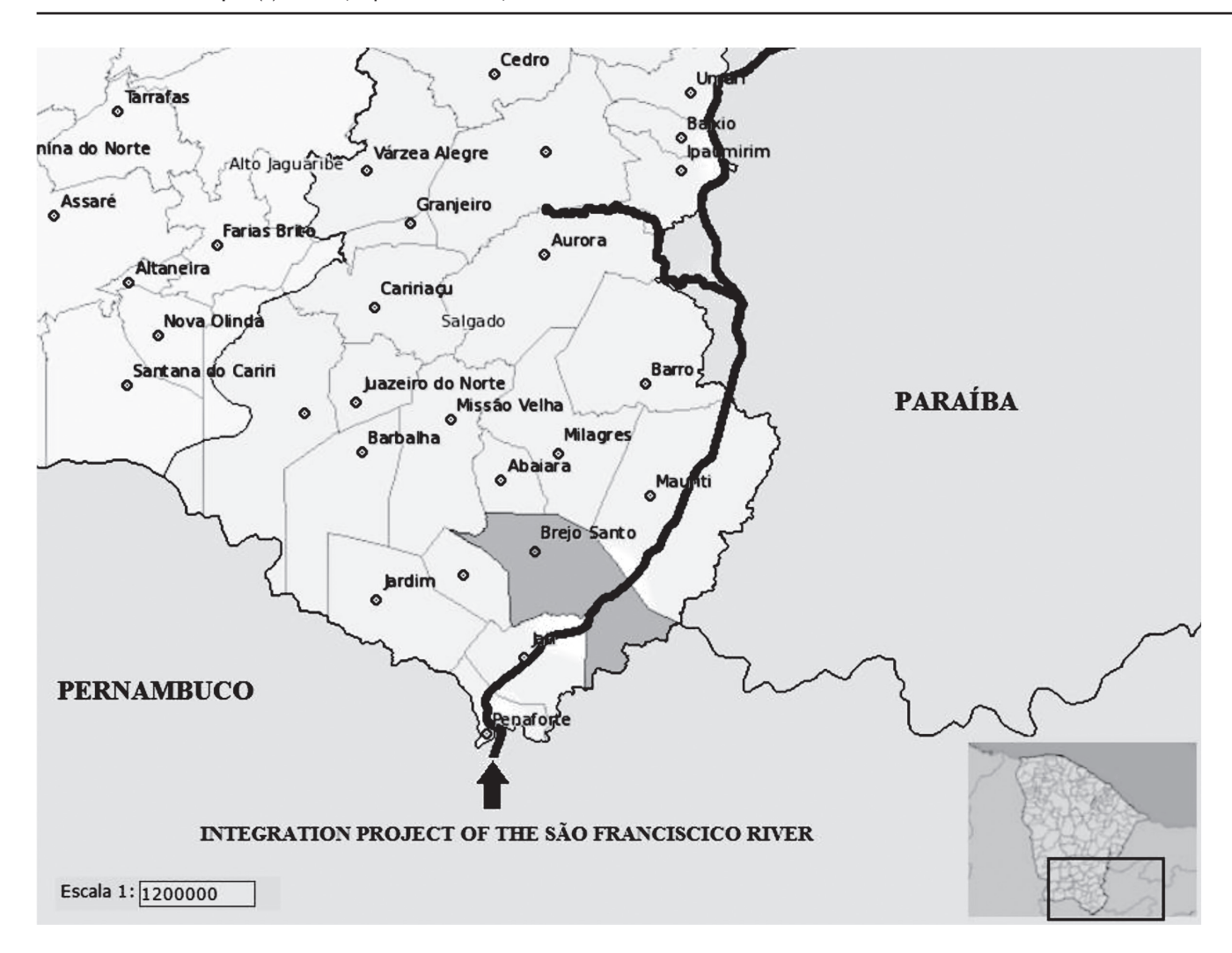
FIGURE 1 - Water transposition project circuit of the São Francisco River, with emphasis on the State of Ceará and the Brejo Santo municipality. Adapted: Secretariat of Water Resources of the State of Ceará.

using the point-of-care circulating cathode antigen (POC-CCA) method. The aliquots were preserved at -20°C until they were transported to Fortaleza, to the Laboratory of Parasitology and Mollusk Biology located at the Federal University of Ceará, where they were stored at -80°C.