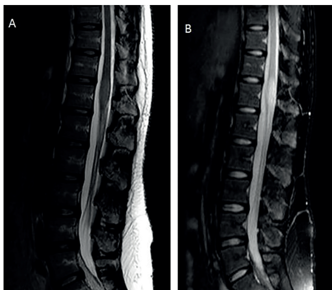
FIGURE 1: (A) Lumbosacral spine MRI without contrast. (B) Resonance showing sign alteration in the medullary cone with contrast enhancement, as well as in some roots of the cauda equina.

Neurological symptoms are not exclusively due to mechanical depositing of the eggs and the secondary formation of granulomas in the nervous tissue, because both immunoallergic response of