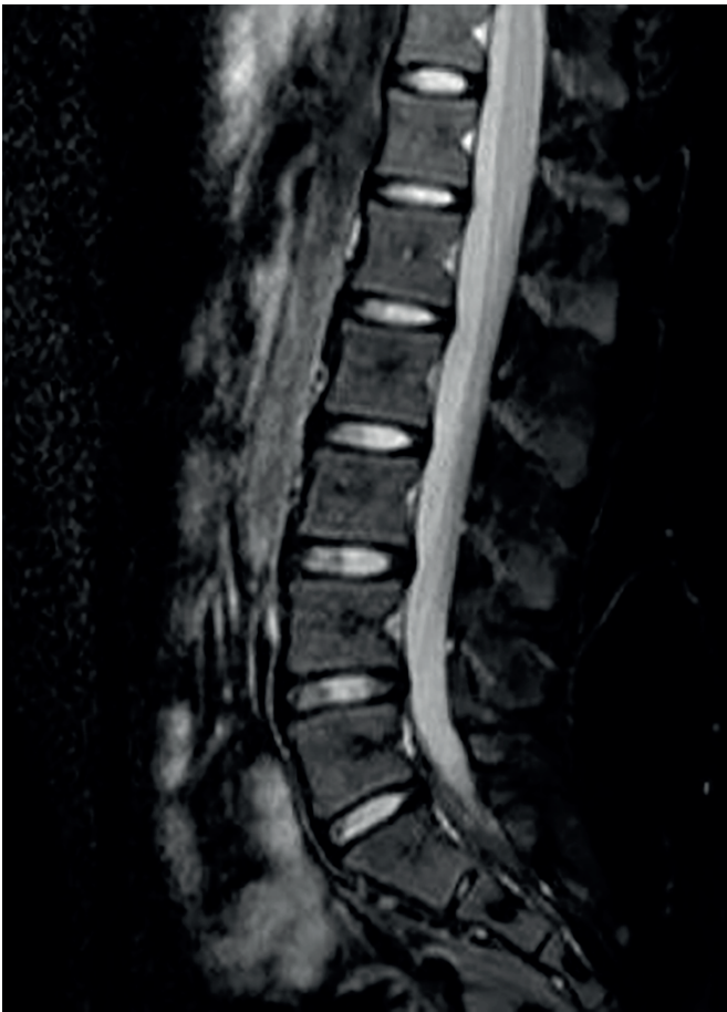
FIGURE 3: Lumbosacral MRI for evolutionary control after treatment, evidencing the complete disappearance of the contrast enhancement in the roots of the cauda equina.

Usually, the disease presents with lower back pain, with varying intensity, and/or lower limb tenderness, with hypoesthesia of the sacral region (S1 to S5), with bladder and rectal sphincter alterations and, sometimes, with paraplegia 1,3 . In this case, the patient presented with lumbar pain and altered sensitivity in the right lower limb but without sphincteric involvement and hypoesthesia of the sacral region.