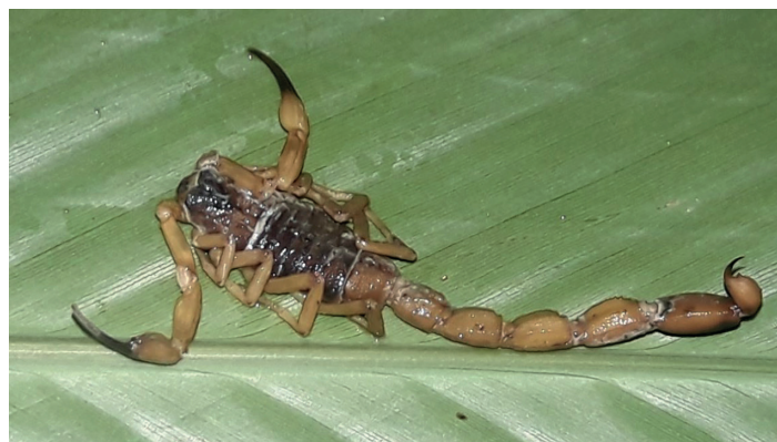
FIGURE 2: Tityus serrulatus scorpion (Lutz & Mello, 1922), responsible for the accident.

Four scorpion families, 12 genera, and 44 species are commonly found in the North region, but T. serrulatus is not among them 6 . T. serrulatus has parthenogenetic reproduction 2 , which is the ability to reproduce without fertilization and without a co-parent. This implies that a single specimen transported to a new location could reproduce and develop a colony. Road networks, which are the main logistics route in Brazil, are presumably enabling the spread of this species. Lourenço and Eicksteadt 9 described the species in the state of Rondônia but did not associate it with any clinical cases. This article describes a scorpion-related envenomation caused by a specimen that was carried in fruit cargo. Torres et al. 10 reported a similar case where a fruit distributor was stung by T. serrulatus while handling green peppers that originated in the state of São Paulo.