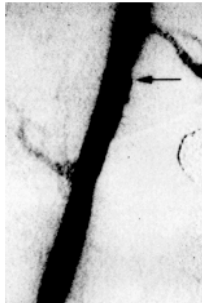
Figure 2 - Arteriography after stenting the intimal flap.

treated surgically because they are considered to predispose thrombosis or rupture 4,5 . For this reason, we opted to correct this intimal flap.