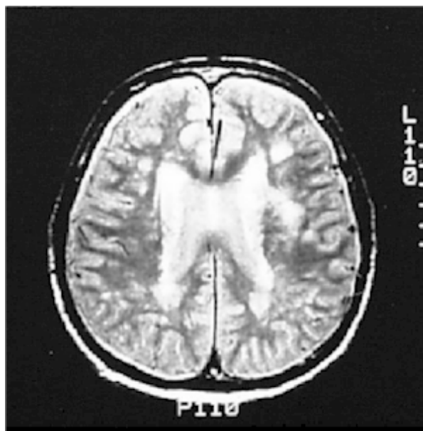
Figure 1 - Nuclear Magnetic Resonance – frontal hemorrhage at the left frontal lobe as well as multiple subacute and chronic lesions widespread through the white matter.

Since image patterns in magnetic resonance and cerebral angiography suggested the presence of some kind of