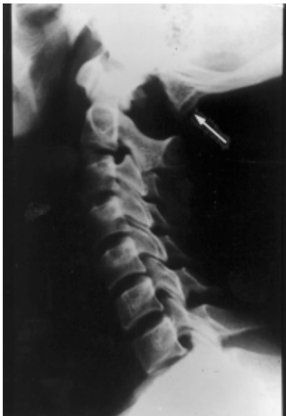
Figure 1 - Lateral view of the cervical spine. Complete absence of the posterior arch of the atlas and a hypertrophic downward projection of the posterior border of the foramen magnum (arrow).