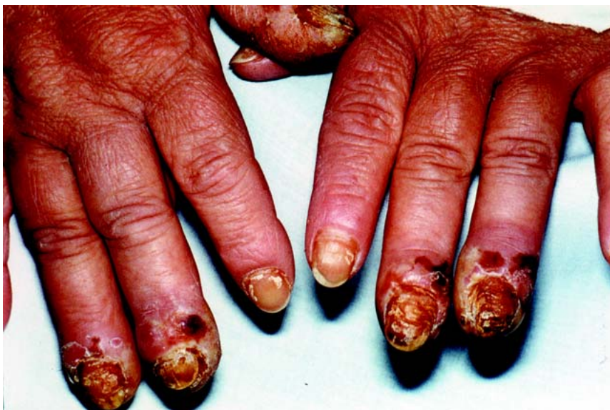
Figure 1 - CASE 1: Erythema, edema, pustules, and hemorrhagic crusts on the nail folds of her fingers. Beau's lines on 3 rd and 4 th left fingernails.

A 39-year-old white woman with pemphigus vulgaris diagnosed in 1990 presented initially with oral erosive lesions. Skin lesions appeared 2 months later. One month after that, the