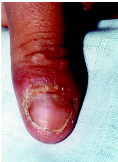
Figure 3 - CASE 3: Erythema, edema, and purulent drainage on the first right finger.