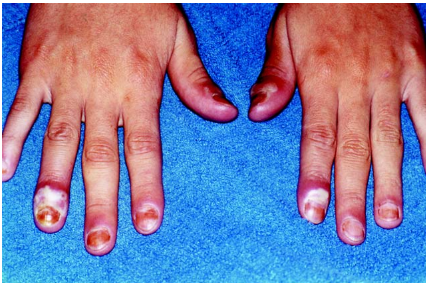
Figure 2 - CASE 2: Erythema, edema, and bullous lesions, with purulent drainage on 1 st and 4 th right fingernails and 1 st and 2 nd left fingernails.