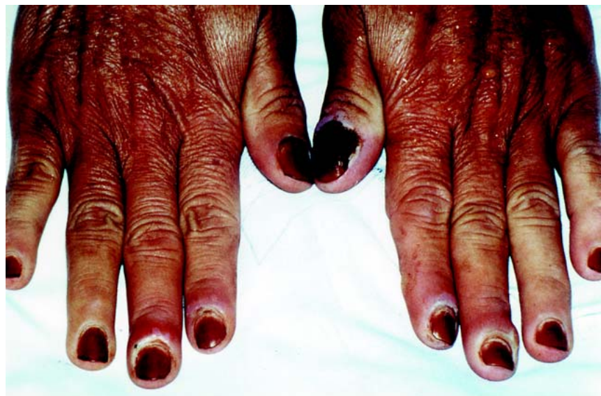
Figure 4 - CASE 4: Erythema and edema on the lateral and posterior nail folds of her 1 st , 2 nd , and 3 rd left and right fingers, with purulent drainage.

nail involvement began. It was characterized by erythema and edema on all 20 nails, with purulent drainage of her left and right first fingers. Nail involvement preceded an exacerbation of mucocutaneous disease. She was diagnosed as having pemphigus vulgaris on the basis of a skin biopsy and direct immunofluorescence. Nail biopsy was not performed. Gram stain and potassium hydroxide preparations were negative. Bacterial and fungal cultures disclosed Staphylococcus aureus , but no fungi. Oral antibiotic therapy produced no beneficial effect on the paronychia. Mucocutaneous lesions and