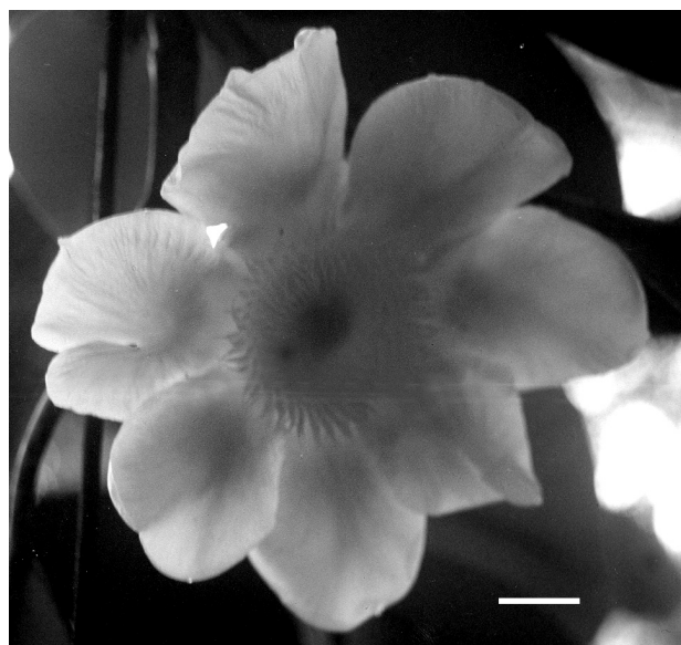
Figure 1 - Flower of Clusia grandiflora . Scale bar = 2 cm.

The flowering of Clusia grandiflora (Figure 1) occurs from February to June (Mesquita, 1989; Bittrich & Amaral, 1997). Flowers bear white petals, which are pink toward the base of the adaxial surface. It is 16 cm in diameter. In male flowers, the stamens are connate at the base and form a crown-like structure around the resin-producing staminodes. The connectives are long awning-like tips which project inwards narrowing the access of the flower visitors to the interior of the flower. The connectives produce droplets of apparently an oil liquid, observed also by Bittrich & Amaral (1997). On the day of anthesis, the staminodes form a plate covered with yellowish opaque resin. The flowers open at about 3.00 a.m. and the resin production starts at about 11.00 p.m. the day before (Bittrich & Amaral, 1997).