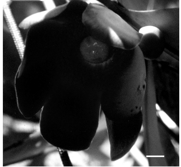
Figure 2 - Flower of Clusia insignis . Scale bar = 1 cm.

In C. insignis , the number of bee species, which visited the flowers, was larger. We observed four species of Euglossini females ( Euglossa piliventris , E. variabilis , E. mourei , and E. stilbonota ), ten of Meliponinae workers ( Melipona bradleyi , Trigona