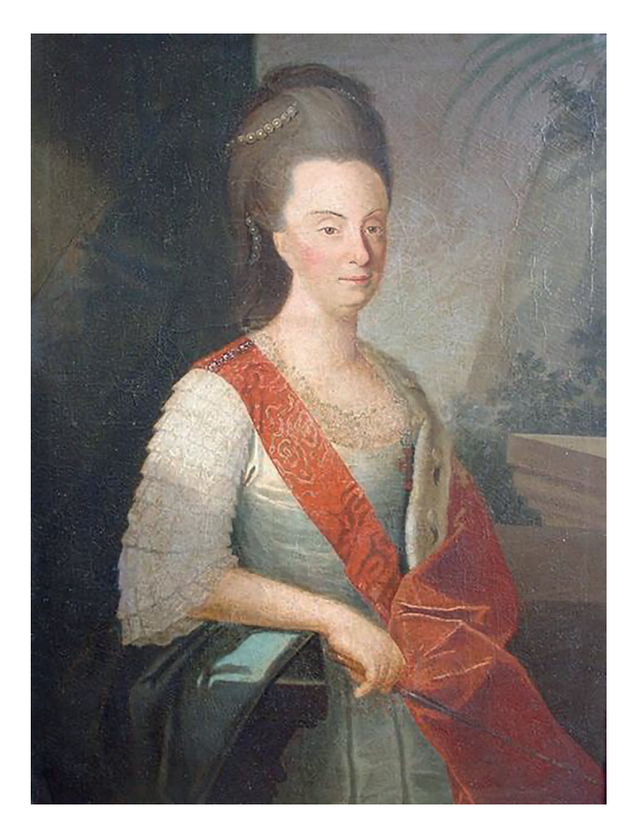
Figure 1. Portrait of Dona Maria I of Portugal (*Lisbon, Portugal, 17 December 1734 - † Rio de Janeiro, Brazil, 20 March 1816) as Queen regnant, circa, 1780, attributed to Inácio de São Paio. Public domain.

is very restricted<sup>4</sup>. There are no medical records regarding the illness of the Portuguese queen<sup>3</sup>. The available information is based mainly on reports from foreign ambassadors and visitors to Lisbon and a Portuguese foreign minister<sup>1,3</sup>. The Portuguese people, at the time, believed that the queen had been poisoned<sup>2</sup>. In a recent biography of D. Maria I, Mary Del Priore<sup>2</sup> speaks of "severe depression". Another biographer of the queen, Jenifer Roberts<sup>1</sup>, proposes the diagnosis of bipolar disorder (BD). Peters and Willis<sup>4</sup>, in turn, refer to "intermittent depression, manic episodes, and anxiety".