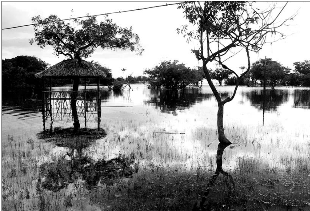
Igarapé do Rio Tapajós, na Universidade de Tamaraguá - PA