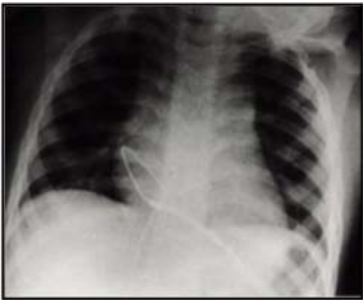
Fig. 1a – Chest radiograph in posterior anterior view demonstrating lead positioning of the ICD implanted via femoral vein.

Programming and assessment of ICD therapies - Programming