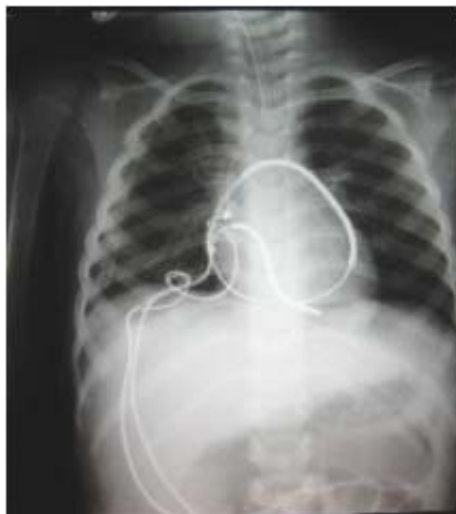
Fig. 1b – Chest radiograph in posterior anterior view showing lead positioning of the ICD implanted via transatrial transthoracic approach.

of the devices was customized considering the underlying heart disease, characteristics of the arrhythmia, clinical conditions and pharmacologic therapy used (Table 2).