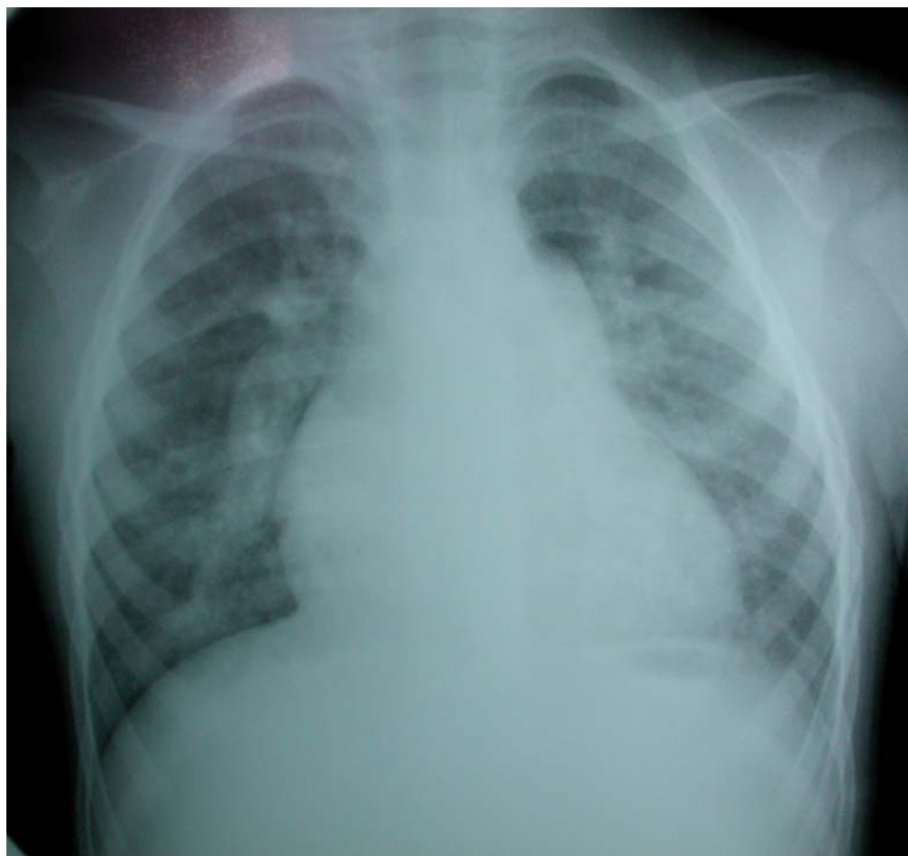
Fig. 1 - Chest X-ray showing increased pulmonary arterial vasculature. When the right atrium and left ventricle are enlarged, a communication between chambers must be considered.