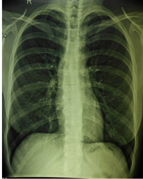
Figure 1 – Chest radiograph shows normal cardiac silhouette, with slightly bulged right upper arch (dilated ascending aorta) and also dilated descending aorta. Hyperdensity can be observed in some lower borders of ribs.