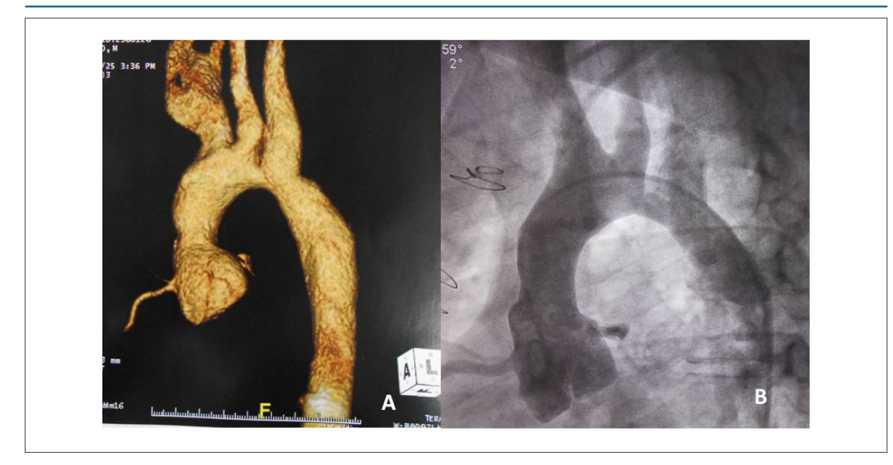
Figure 1 – Chest tomography (A) and aortic angiography (B) clearly show the coarctation of the aortic arch after the left carotid artery, featuring coarctation of this region in progression.