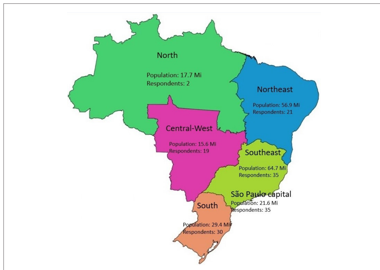
Figure 1 – CMR survey respondents’ geographic distribution (adapted from https://suportegeografico77.blogspot.com/2019/04/mapa-regioes-do-brasil.html ).

The questionnaire contained questions covering the respondents (workplace, expertise, and number of cardiac surgeries performed at his/her main reference institution), CMR practices (availability, specialist performing the exams, and frequency of CMR exams), clinical contexts of the patients (CMR indication, readiness to proceed with Fontan operation without a prior cardiac catheterization, among others), and barriers faced when using CMR in this population. Questionnaires containing only answers about the respondents were excluded from the analysis, since this information alone would have not added relevant data to the objectives of the study. The same questionnaire was sent out to a WhatsApp group of cardiac imagers with pediatric/congenital expertise in Brazil, in which the first author participates, with the objective of obtaining data on their numbers of CMR exams and their CMR practices.