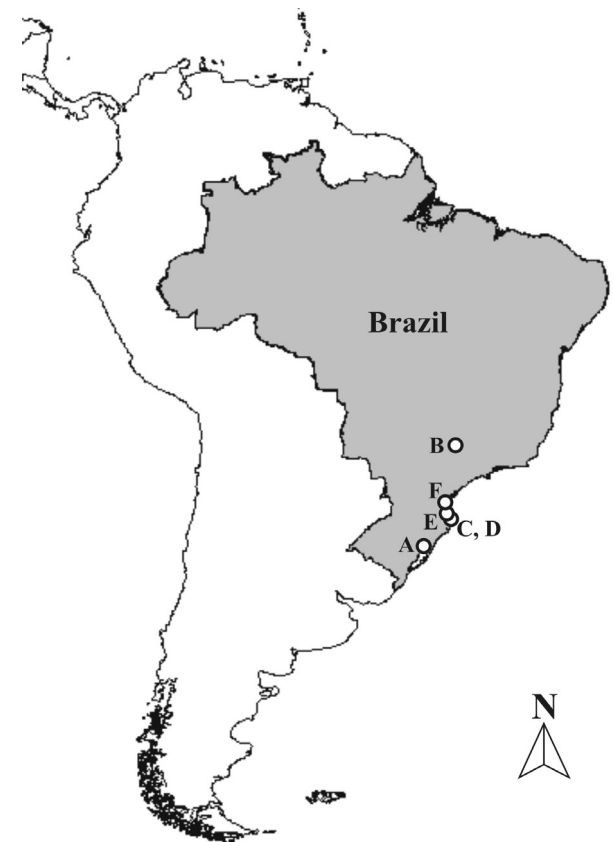
Figure 1. South America map indicating the sampled sites in Brazil of the Drosophilidae species associated to fruiting bodies of fungi in forested and anthropized environments (A, Campus of Universidade Federal do Rio Grande do Sul, Porto Alegre, RS; B, Campus of Universidade de São Paulo, Ribeirão Preto, SP; C, Campus of Universidade Federal de Santa Catarina, Florianópolis, SC; D, Morro da Lagoa da Conceição, Florianópolis, SC; E, Biguaçu, SC; F, Piraf, Joinville, SC).

A total of 910 individuals belonging to 31 Drosophilidae species were collected (Tabs. I, II). Among the drosophilid genera collected, Drosophila was the richest (17 species) and the most abundant in all environments sampled, even when compared to other exclusively mycophagous species, like Hirtodrosophila (five species), Leucophenga (two species) and Mycodrosophila (two species).