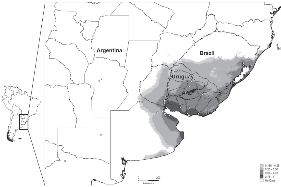
Fig. 19. Latonigena auricomis Simon, 1893, known records and potential predicted range of the species.

Geographic distribution. The distribution model indicates that the most suitable area for the species is situated on southern Uruguay and province of Buenos Aires, Argentina, but the distribution of the species could comprise almost all the Uruguayan territory, and parts of the states of Rio Grande do Sul and Santa Catarina in Brazil and the provinces of Buenos Aires, Entre Ríos, Santa Fe, Córdoba, and Corrientes in Argentina (Fig. 19). The presence was set over the 0.196 logistic threshold and the algorithm converged after 720 iterations. Others thresholds were selected and the same performance of the model was obtained. The AUC test for training data was 0.960 that indicate a very good prediction of the model. The Jackknife analysis showed that the Precipitation of Driest Month (38.7%), Isothermality (20.5%) and Temperature Seasonality (18.2%) were the most important climatic