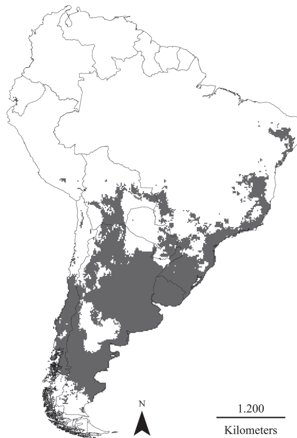
Fig. 3. Potential distribution model for Galictis cuja (Molina, 1782) visualized across South America (in gray).