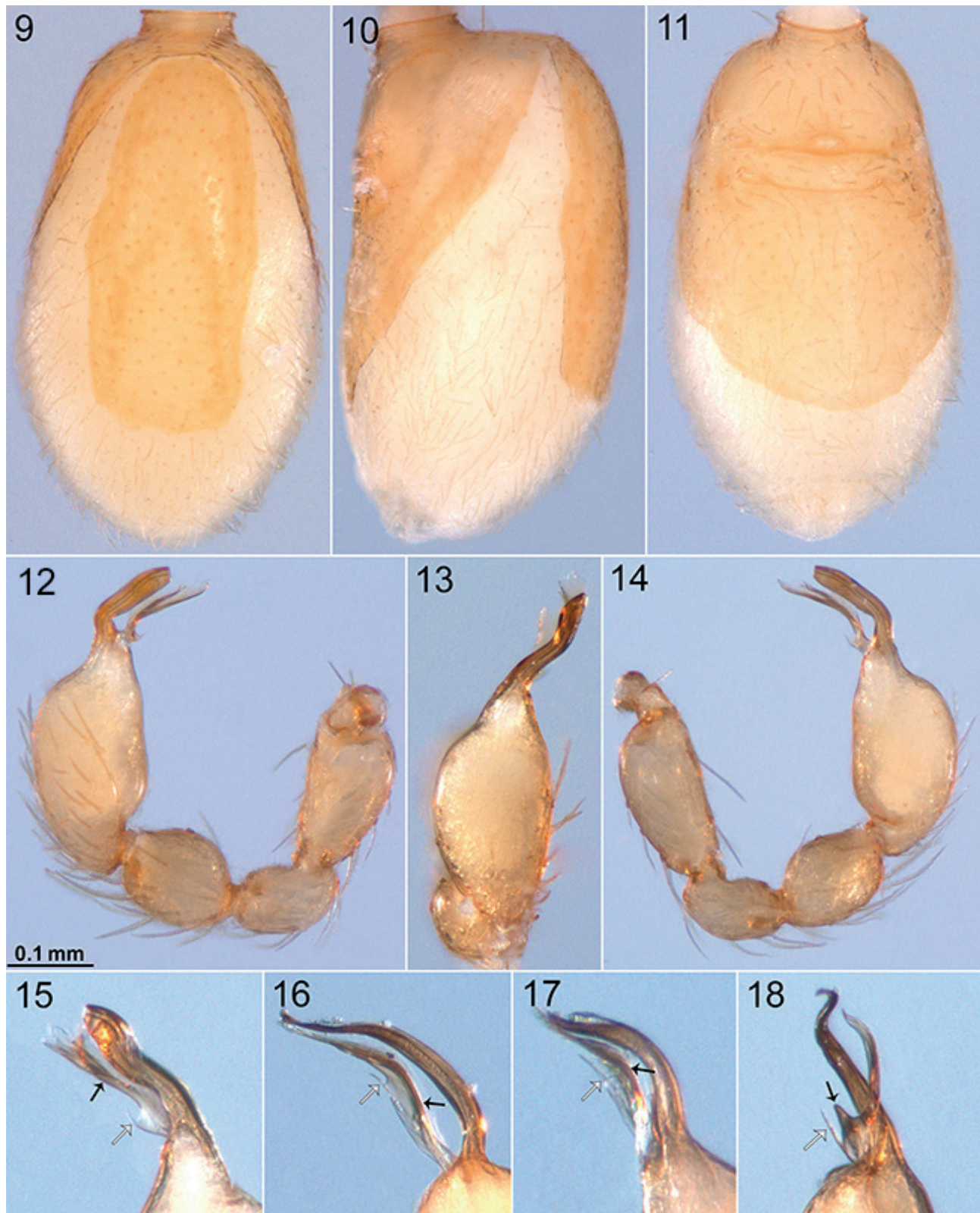
Figs 9–18. Males of Simlops species. Simlops kartabo sp. nov.: abdomen: 9, dorsal; 10, lateral; 11, ventral; palp: 12, prolateral; 13, dorsal; 14, retrolateral; distal portion of the palp: 15, retro-ventral; Simlops bodanus (Chickering, 1968): 16, distal portion of palp, retrolateral. Simlops guyanensis Santos, 2014: 17, distal portion of palp, retrolateral. Simlops guatopo Brescovit, 2014: 18, distal portion of palp, retroventral. Black arrows: conductor, sub-basal process. White arrows: conductor, needle-like process.