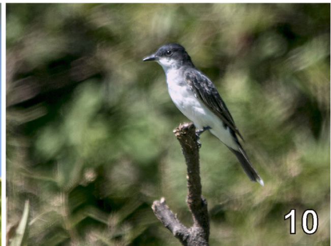
Figs 7–10. Photographic documentation for three species added to the main list of birds of Rio Grande do Sul, Brazil: 7, Todirostrum cinereum , Palmeira das Missões, 7 November 2015; 8, Pseudocolopteryx acutipennis , Mostardas, 28 December 2015; 9, 10, Tyrannus tyrannus , Mostardas, 7 February 2017.