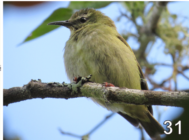
Figs 30, 31. Photographic records of two species added as hypothetical to the list of birds of Rio Grande do Sul, Brazil: 30, Progne cf. sinaloae , Coxilha, 24 September 2016; 31, Cyanerpes cyaneus , female, Santo Antônio da Patrulha, 27 July 2015.

al. (2010) provided photographic evidence for the occurrence of hudsonicus in RGS and attributed all documented records of whimbrels hitherto known from the state to this form (as N. phaeopus hudsonicus ). Following the split of hudsonicus , this species should replace N. phaeopus in the RGS list. However, one individual of the Eurasian Whimbrel was recently photographed on the coast of RGS by a group of birdwatchers (Tab. I), thus justifying the maintenance of this species on the state list. The extensively white rump and uppertail-coverts of the bird rule out the commoner American Whimbrel (O'BRIEN et al. , 2006).