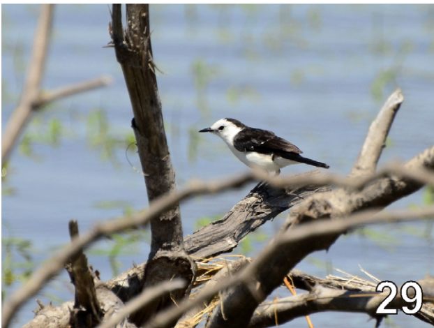
Figs 27–29. Documentation updates for three species previously included in the main list of birds of Rio Grande do Sul, Brazil: 27, Nannochordeiles pusillus , presumed female, Itaqui, 27 November 2011 (D. V. Peixoto); 28, Campephilus leucopogon , male (right) and female (left), Barra do Quaraí, 28 May 2015 (C. E. Agne); 29, Fluvicola albiventer , Uruguaiana, 23 October 2015 (R. O. de Oliveira).

more southern latitudes of the Old World (HIRSCHFELD et al. , 2000; WIERSMA et al. , 2017a,b). Vagrancy is common, with both species being recorded in North America and C. mongolus also in South America (ABBOTT et al. , 2001; LE NEVÉ & MANZIONE, 2011; WIERSMA et al. , 2017a,b). Clear separation of these species based on photographs of