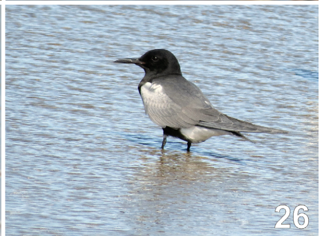
Figs 21–26. Documentation updates for four species previously included in the main list of birds of Rio Grande do Sul, Brazil: 21, Chondrohierax uncinatus , adult female, Tenente Portela, 4 February 2017 (C. Furini); 22, Pseudastur polionotus , Vacaria, 3 May 2015 (E. Rezende); 23, 24, Calidris pugnax , presumed male, Tavares, 15 February 2015 (M. Alievi); 25, Chlidonias niger , molting nonbreeding adult, Mostardas, 8 January 2014 (P. Fenalti); 26, C. niger , adult in alternate plumage, Rio Grande, 8 March 2016 (R. Kurz).

ratio ranged from 1.86–2.0 in WA1943013 and 1.94–2.04 in WA1944101 (variation of four different measurements of both tarsus and bill). The species is a mid-sized Charadrius , judging by comparisons with a Calidris fuscicollis (Vieillot, 1819) and two Charadrius semipalmatus Bonaparte, 1825 that appear in the background of WA1944101 and WA1963959, respectively.