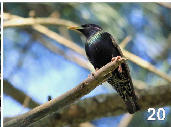
Figs 15–20. Photographic documentation for five species added to the main list of birds of Rio Grande do Sul, Brazil: 15, Donacobius atricapilla , São Borja, 18 June 2015; 16, Catharus cf. swainsoni , Marques de Souza, 18 January 2016; 17, Tangara ornata , Três Cachoeiras, 30 January 2010; 18, 19, Thlypopsis sordida , Uruguaiana, 12 June 2016; 20, Sturnus vulgaris , male in breeding season, Lavras do Sul, 29 October 2014.

Andes. At least the southern populations of these species are migratory and winter in lower latitudes of the continent, mostly in north-central Argentina, Paraguay and southern Bolivia, or along either coast of South America or the Andes, as far north as southern Peru and Uruguay. Among these, Chloephaga picta , Muscisaxicola capistratus and Agriornis