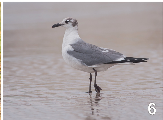
Figs 1–6. Photographic documentation for six species added to the main list of birds of Rio Grande do Sul, Brazil: 1, Phoebetria palpebrata , Arroio do Sal, 5 October 2016 (M. Tavares); 2, Ictinia mississippiensis , juvenile, Ijuí, 6 November 2016 (C. E. Agne); 3, Heliornis fulica , presumed male, Marau, 17 October 2015 (C. Longo); 4, Tringa inornata , adult nonbreeding, São José do Norte, 17 April 2014 (C. D. Timm); 5, Thinocorus rumicivorus , male (left) and female (right), Tavares, 5 August 2016 (F. Ronaldo); 6, Leucophaeus atricilla , adult nonbreeding, Cidreira, 7 January 2016 (P. Fenalti).

are thus overshooting vagrants from North America. Two other Nearctic species, Ictinia mississippiensis and Tyrannus tyrannus , winter in areas much closer to RGS in central South America and were already somewhat expected. Both occur as vagrants or irregular visitors to adjacent areas of Argentina, and the latter has also been recently found south of our study