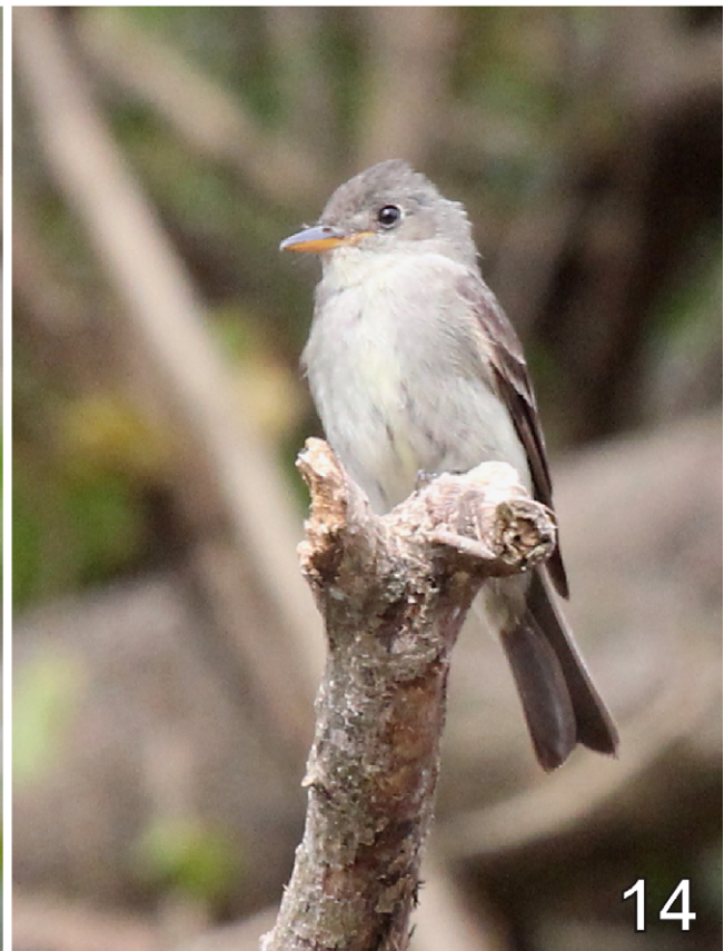
Figs 11–14. Contopus virens , Tavares, 8 November 2016. Note the whitish throat, center breast and belly contrasting with the darker breast-sides (giving a “vested” appearance), relatively long, pointed wings, distinct wing bars, and rather heavy-looking bill, which exclude the sympatric C. cinereus . The combination of a pale overall coloration (especially underneath), extensively orange-yellow lower mandible and relatively long tail extension are consistent with C. virens and not C. sordidulus .

casual or accidental vagrants to RGS and South America, since both records involved migrating birds that obviously strayed well off their normal routes. The occurrence of the latter is presumably linked to the transatlantic vagrancy of Palearctic migrants headed to Africa from northwestern Europe. Such birds may continue heading south after arriving in equatorial South America or the Caribbean and may eventually reach higher latitudes along the Brazilian coast. The only previous records of N. phaeopus in Brazil are from Fernando de Noronha Archipelago, a well-known vagrant