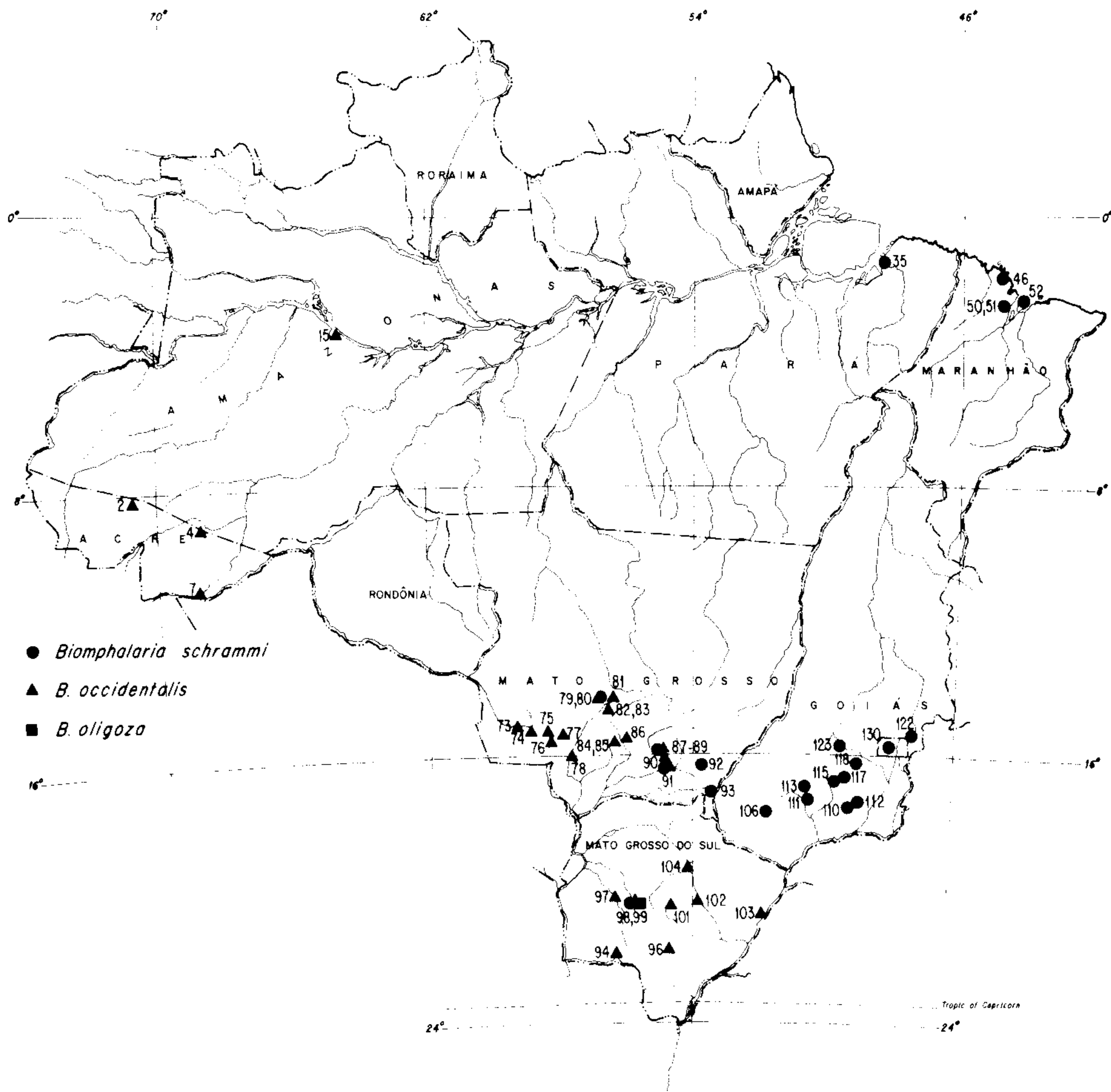
Fig. 2 – Distribution of biomphalarid snails nonvectors of Schistosoma mansoni in the Brazilian states and territories of the Amazon river basin, examined in the present survey. Numbering of localities as in Table I.

Rosário Oeste, Santa Elvira, Várzea Grande (Paraense, 1981); Cachoeirinha, Jaciara, Jauru, Quatro Marcos.