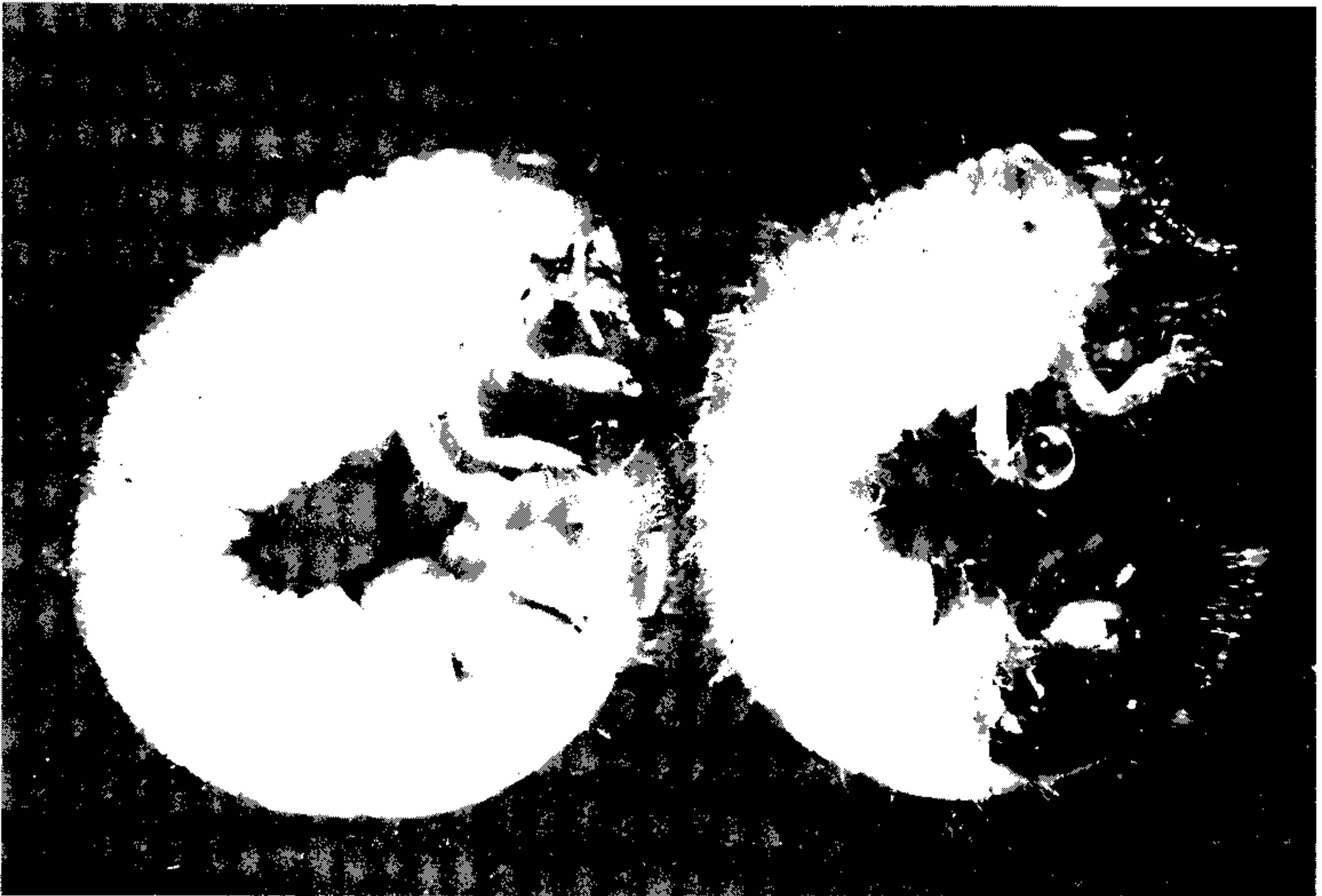
Fig. 1: milky disease infected (right) and healthy (left) Popillia japonica larvae.

Since milky disease bacteria reproduce in the host and reinoculate the soil, they have been introduced into the environment for permanent es-