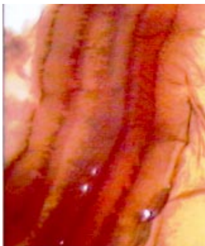
Fig. 3: presence of renal ridge in specimens from generation F1 of crossbreeding between pigmented Biomphalaria glabrata (Paulista, PE) and albino B. tenagophila (Joinville, SC) (magnified 40X).