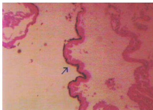
Fig. 4: presence of renal ridge, observed in longitudinal cross section, in specimens from generation F1 of crossbreeding between pigmented Biomphalaria glabrata (Paulista, PE) and albino B. tenagophila (Joinville, SC) (magnified 40X).

Tables III and IV show the fecundity and fertility results for generation F2 reared in isolation and grouped. A proportional equivalence was observed for values obtained for the number of eggs/egg-masses at week 7 for the two situations (Table III). In terms of fertility, both in isolation and grouped, production of fertile eggs and eclosion of snails were achieved.