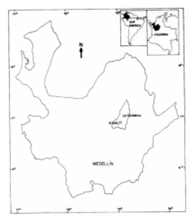
Fig. 1: study area. La Gardenia, Antioquia, Colombia, where Panstrongylus rufotuberculatus was found reproducing in intradomicile.