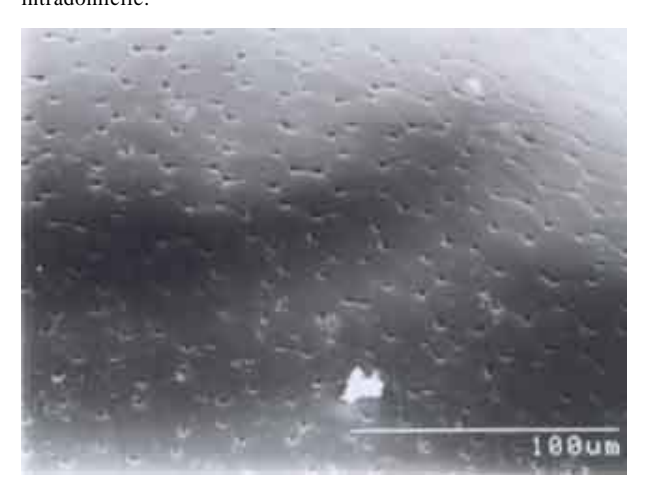
Fig. 2: scanning electron microscopy (500 x). Details of the external cover of egg of Panstrongylus rufotuberculatus from indoors, in La Gardenia, Antioquia, Colombia.

tion technique (García Da Silva et al. 1993); they were submitted to feces revision, in order to evaluate positivity for Trypanosoma , upon arrival in the laboratory, after 30 and 45 days.