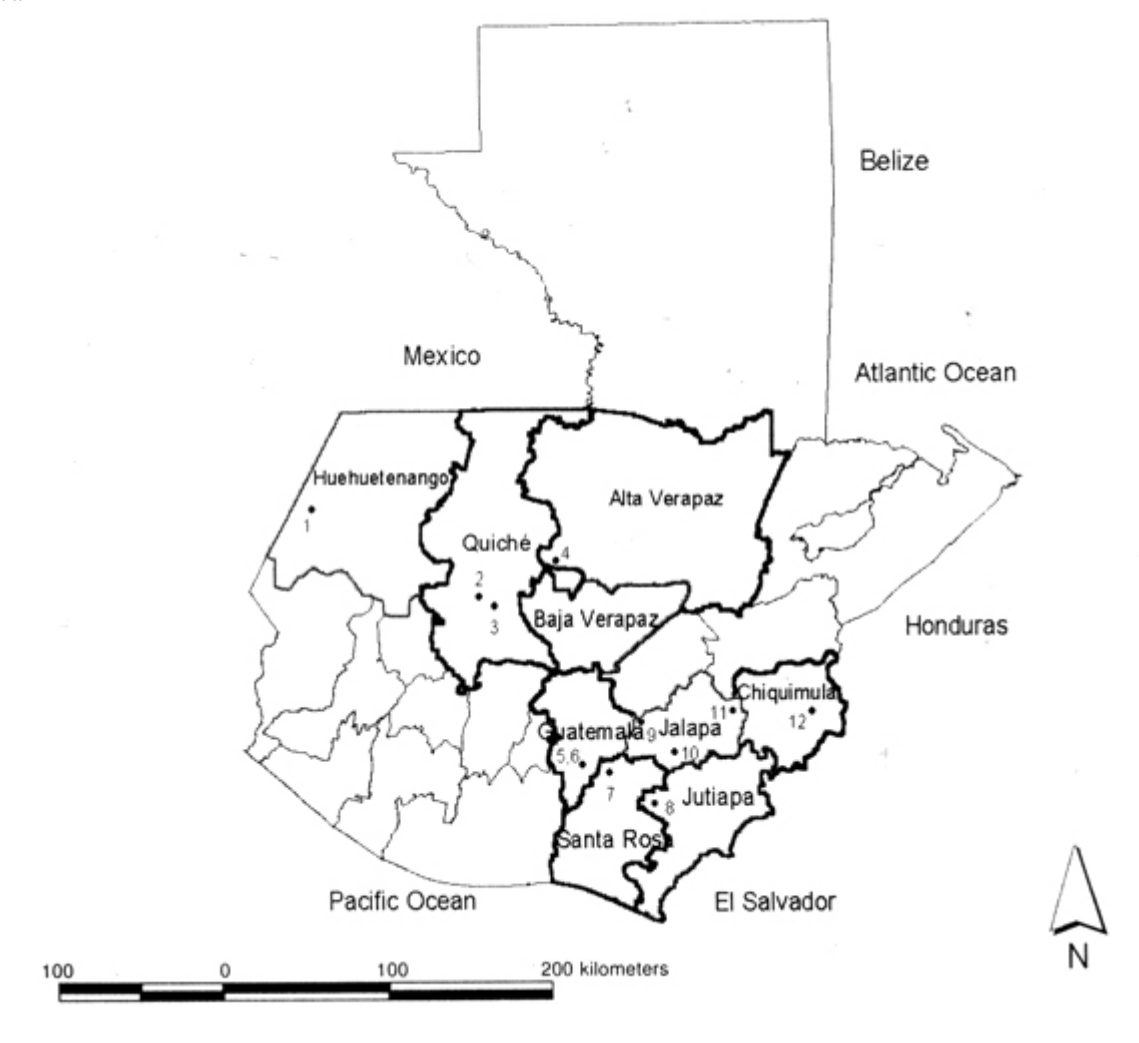
Fig. 2: map of Guatemala showing the nine departments where Triatoma nitida have been collected, and some of the localities where it was collected in this study (see Tables I and II). Localities: 1. San Isidro, La Democracia; 2. San Andrés Sajcabajá, San Andrés Sajcabajá; 3. Chamop, San Bartolomé Jocotenango; 4. Santa Elena, San Cristóbal; 5-6. Santa Rosita and San Cristobal, Villa Canales. 7. Primera Sabana, Santa Rosa de Lima; 8. El Copante, San Jose Acatempa; 9. Laguna Verde, Jalapa; 10. San Juan Salamos, Monjas; 11. Pie de La Cuesta, San Pedro Pinula; 12. Las Palmas, Olopa

T. nitida was previously reported in Guatemala in the departments of Baja Verapaz, Alta Verapaz, Chiquimula, Jalapa and Guatemala (Peñalver 1953, Tabaru et al. 1999). This is the first report of the presence of this species in the departments of Huehuetenango, Jutiapa, Quiche and Santa Rosa. All the sites where T. nitida was present are located between 960 and 1500 m altitude. In Guatemala, domestic triatomines are in most cases present between 800 and 1600 m, and seldom above this altitude (Tabaru et al. 1999). There is a similar report for T. nitida in Oaxaca, Mexico, where only three insects were collected by homeowners in two out of 92 surveyed villages, within an altitude range of 1100 to 1520 m.a.s.l. (Ramsev et al. 2000).