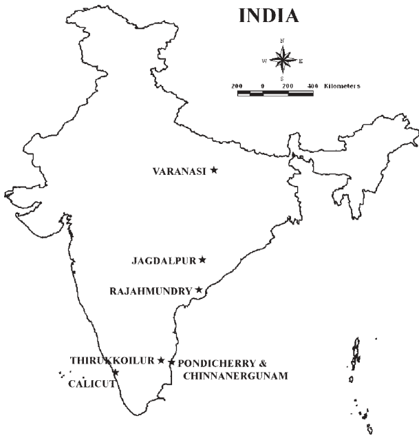
Fig. 1: map showing different geographic locations of India from where microfilariae of Wuchereria bancrofti were collected.

ribosomal gene lie at nucleotide position 27 to 46 and 1495 to 1515, respectively. The polymerase chain reaction (PCR) mixture consisted of dNTP - 20 mM of each nucleotide (Finnzymes, Finland); MgCl_2 - 2.5 mM (Finnzymes); Forward and Reverse Primer (Synthesized from Metabion, Germany) - 10 pmol each, 10X Dynazyme buffer, Dynazyme II Taq polymerase - 3 units (Finnzymes, Finland), template mf DNA 10 ng and distilled water (Sigma, US). B. malayi mf DNA known to harbor Wolbachia endosymbiont ribosomal gene was used as positive control and distilled water instead of template DNA was used as negative control for PCR. Amplification was run on a Master Cycler Gradient (Eppendorf). The PCR programme consisted of an initial denaturation at 96°C for 4 min followed by 35 cycles of denaturation at 94°C for 1 min, annealing at 56°C for 1 min and extension at 72°C for 2 min with a final extension step of 72°C for 7 min. The amplified products were detected by running a 1.5% agarose gel with Lambda DNA/Hind III and Phi X 174 DNA/Hae III Mix molecular weight marker (NEB, US). The gels were stained in ethidium bromide, observed under UV transilluminator and then photographed (Fig. 2a, b).