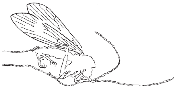
Fig. 1: Pintomyia (Pifanomyia) brazilorum sp. nov. General aspects.

Type material: holotype, Dominican Republic, north Santiago, specimen in amber from the mid-Miocene period, deposited in the phlebotomine sand fly collection of the Centro de Pesquisas René Rachou (Fundação Oswaldo Cruz), Belo Horizonte, MG, Brazil.