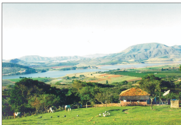
Fig. 2: sites studied with a view of the Furnas hydroelectric reservoir, Mata's farm.

The index of species abundance (ISA) was calculated based on the data obtained from the captures in the automatic light traps in the six environments sampled. For calculation of this index, the formula defined by Roberts and Hsi (1979) was used: