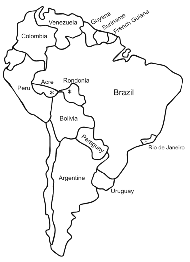
Fig. 1: map of Brazil, showing the areas from which DENV-3 viruses were isolated (*) and the borders of the countries of South America.

Sequencing strategy, multiple sequence alignment and phylogenetic analysis - The amplicons were directly sequenced using a Thermo Sequenase kit (USB Inc, Ohio, USA) on an ABI3100 device, with the Big-Dye7 Terminator method (Applied Biosystems, Warrington, UK). Nucleotide sequences were analyzed with a Phred/Phrap/Consed package (www.phrap.org). Sequences were obtained from the 5' and 3' UTR of the BR DEN3/290-02, BR DEN3/95-04, BR DEN3/97-04, BR DEN3/98-04, BR DEN3/RO1-02 and BR DEN3/RO2-02 samples after uncapping and RNA ligation, as described elsewhere (Duarte dos Santos et al. 2000). Primer sequences are available upon request.