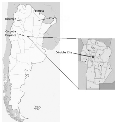
Fig. 1: map showing location of the city of Córdoba, in the province of Córdoba, Argentina.

Detection of antibodies in humans - Serum samples from humans between the ages of zero-80 years were screened for antibodies to RNV using the neutralization test (NT) (Early et al. 1967). Positive samples were also tested against PIXV to discard cross reactions. NTs were performed using African green monkey kidney (Vero) cells. Samples were collected in Córdoba (in Health Centres from municipality of Córdoba) between November 2004-April 2005, during an outbreak of St. Louis encephalitis virus (Spinsanti et al. 2008). All samples were initially tested at a dilution of 1:10 and positive samples were further titrated to determine the end-point titer. This study was designed as a non-associated anonymous survey; the only data registered were the number of the sample, the date of sampling and the subject's age (years) and address (street and neighbourhood).