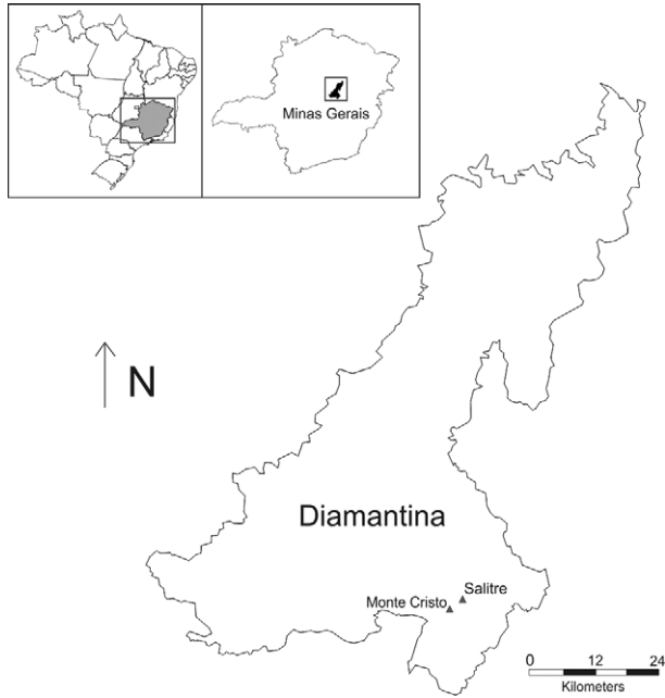
Fig. 1: geographical localization of the municipality of Diamantina, state of Minas Gerais, Brazil.

missing or damaged characters that prevented identification at the species level were identified as Lutzomyia spp. The females belonging to the genus Brumptomyia were not identified to the species level. The temperature and humidity were measured with a thermohygrometer at the capture site. The rainfall data were obtained from the Brazilian Meteorology Institute ( inmet.gov.br/sim/sonabra/convencionais.php ).