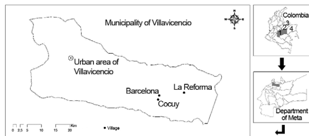
Fig. 1: geographic location of the study area in Colombia and in department of Meta compound of the villages Barcelona, Cocuy and La Reforma. 1: Meta; 2: Casanare; 3: Arauca; 4: Vichada.

A total of 22,094 Lutzomyia specimens were captured during the seasonal sampling. The evaluation of the richness observed at each habitat revealed seven species captured in the intradomiciliary areas, 18 in the peridomiciliary areas and 19 in the extradomiciliary areas. The most abundant species was Lu. antunesi (89%), followed by various species with vector backgrounds: Lu. panamensis (2.3%), Lutzomyia flaviscutellata (1.05%), Lu. gomezi (0.8%) and Lutzomyia fairtigi (0.6%) (Table I). The seasonal variation analysis obtained by ANOVA